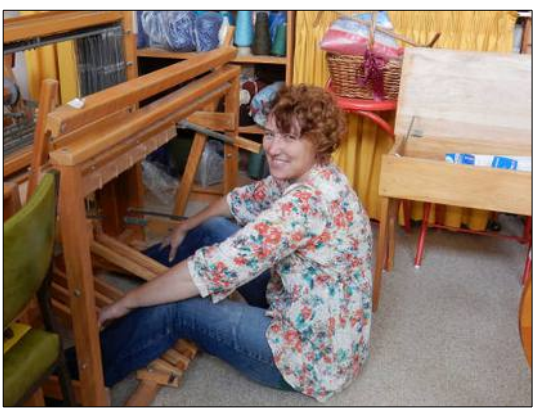
Our President getting down to the business end of one of the floor looms!

In anticipation of the increased numbers and TAFE involvement, which we hope will become a regular event, many busy workers have re-arranged the looms, tables and chairs to give us a more practical working surfaces. So if you haven't been to a workday for a while, you may notice some changes:)